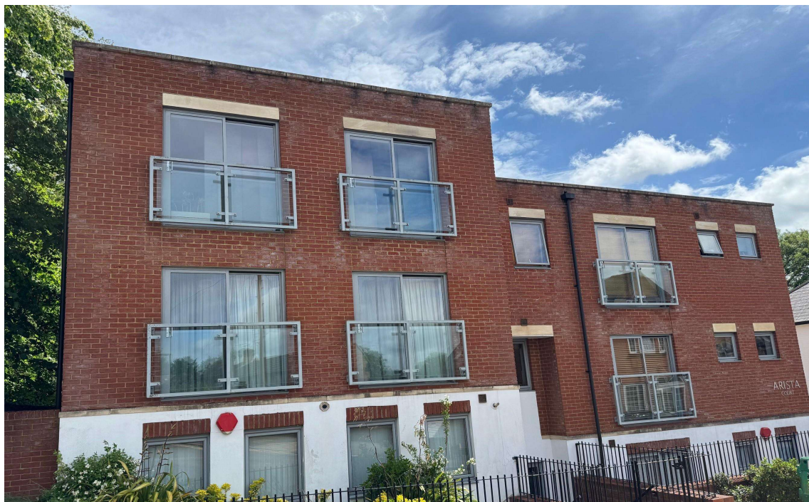
Harvest Road, Englefield Green, TW20 0SG