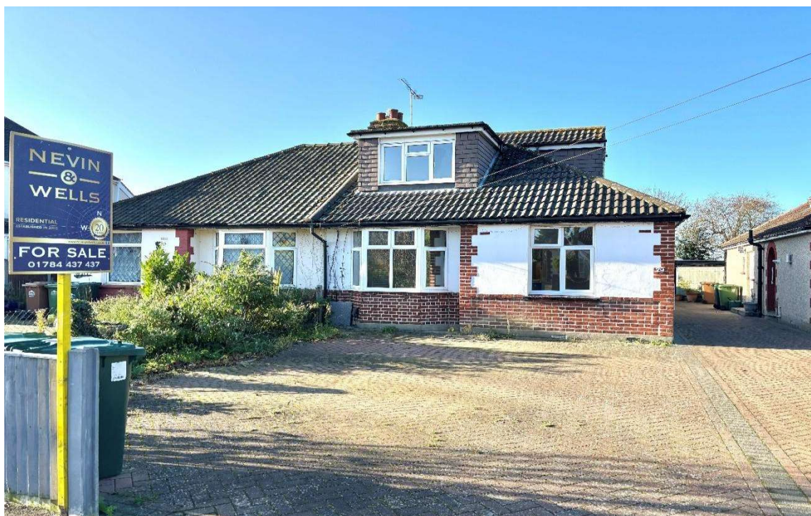
Chattern Road, Ashford, Middlesex, TW15 1AE