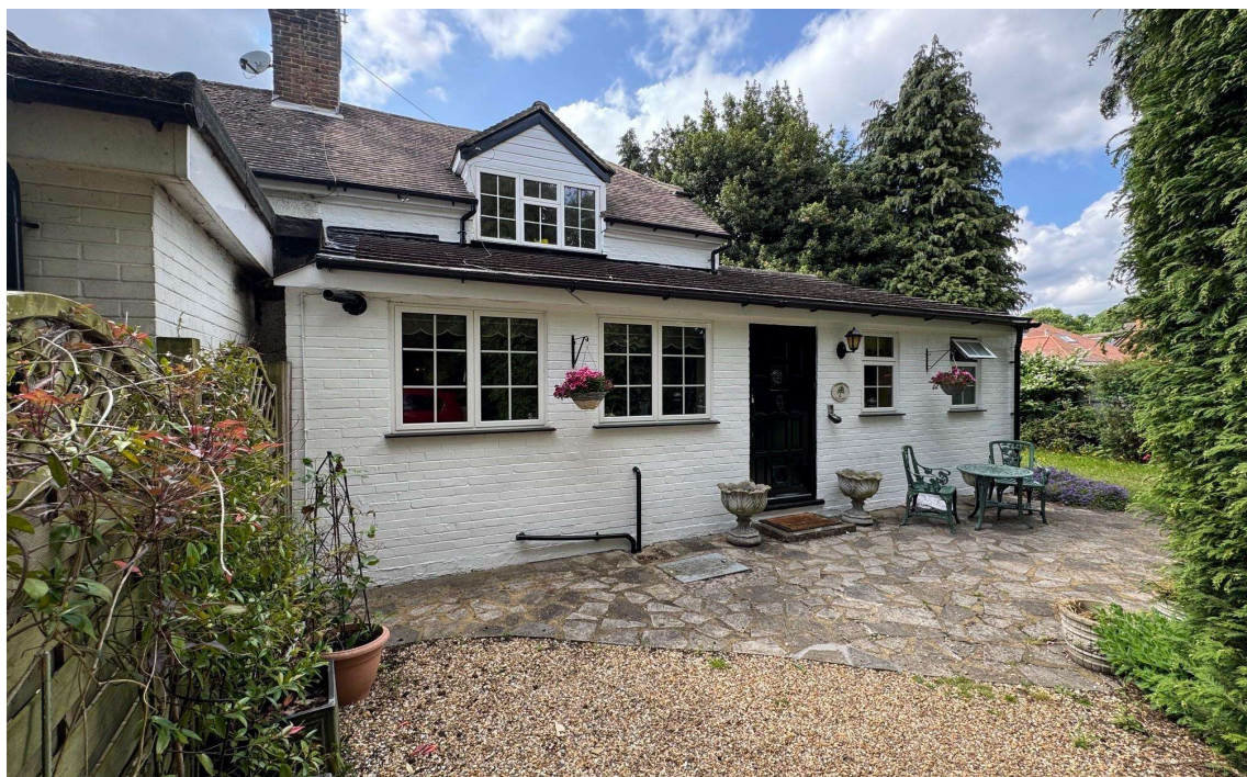
Mill House Lane, TW20 8QS