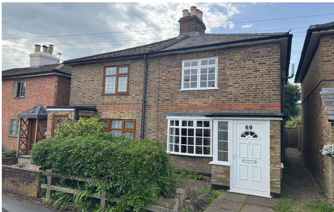
Bond Street, Englefield Green, TW20 0PL