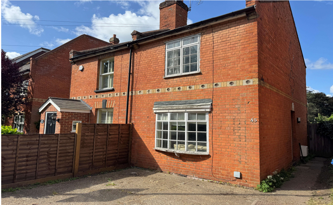
St Jude's Road, TW20 0BT