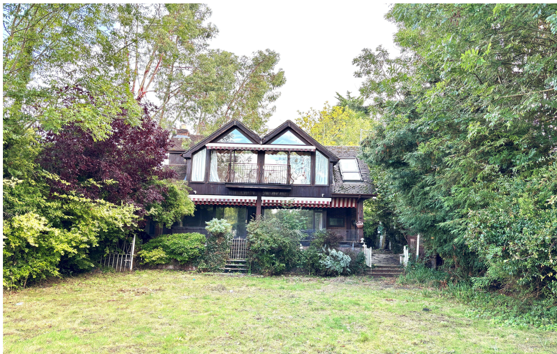
Hythe End Road, Wraysbury, TW19 5AP