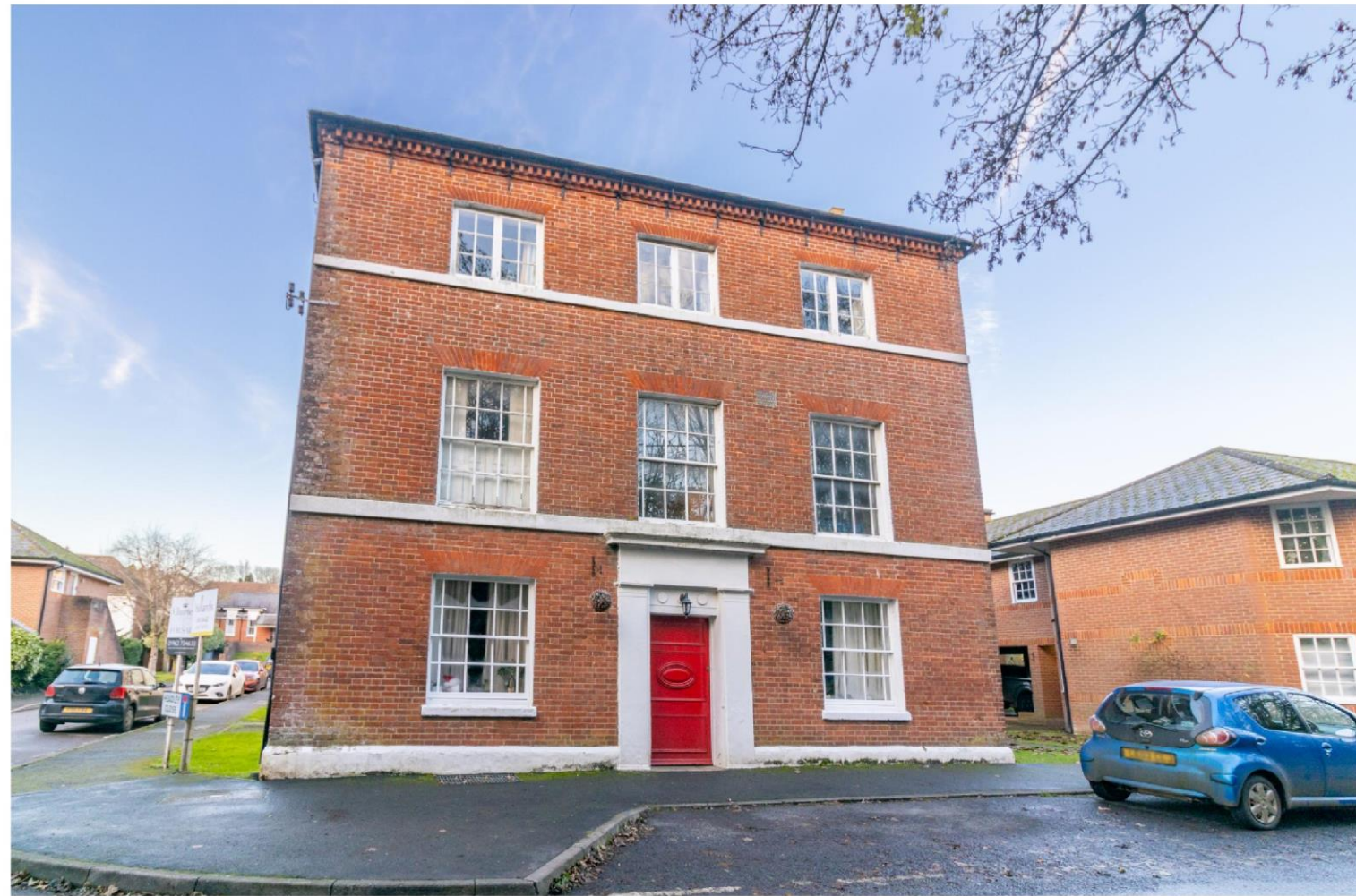
At home in Alresford