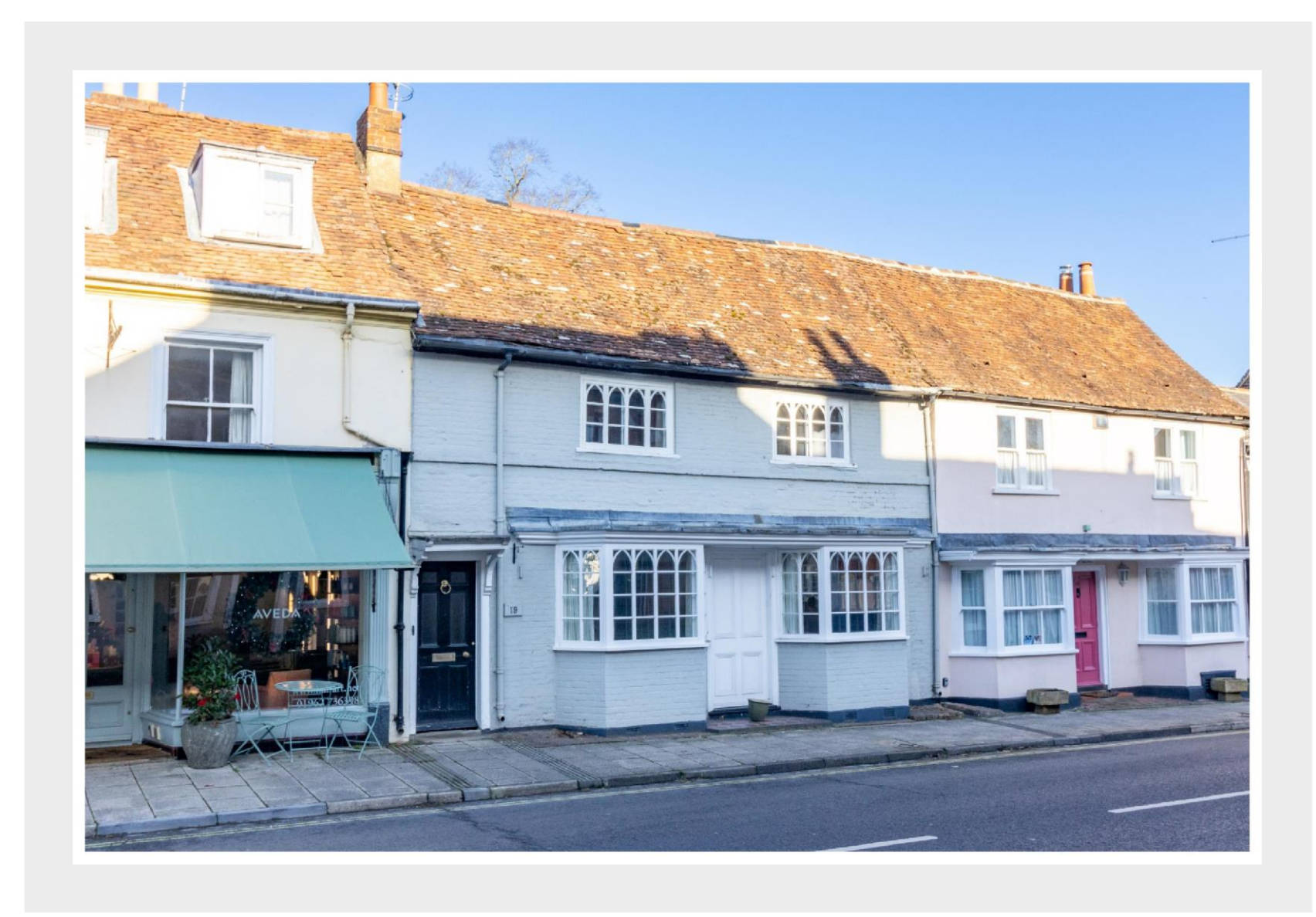
At home in Alresford