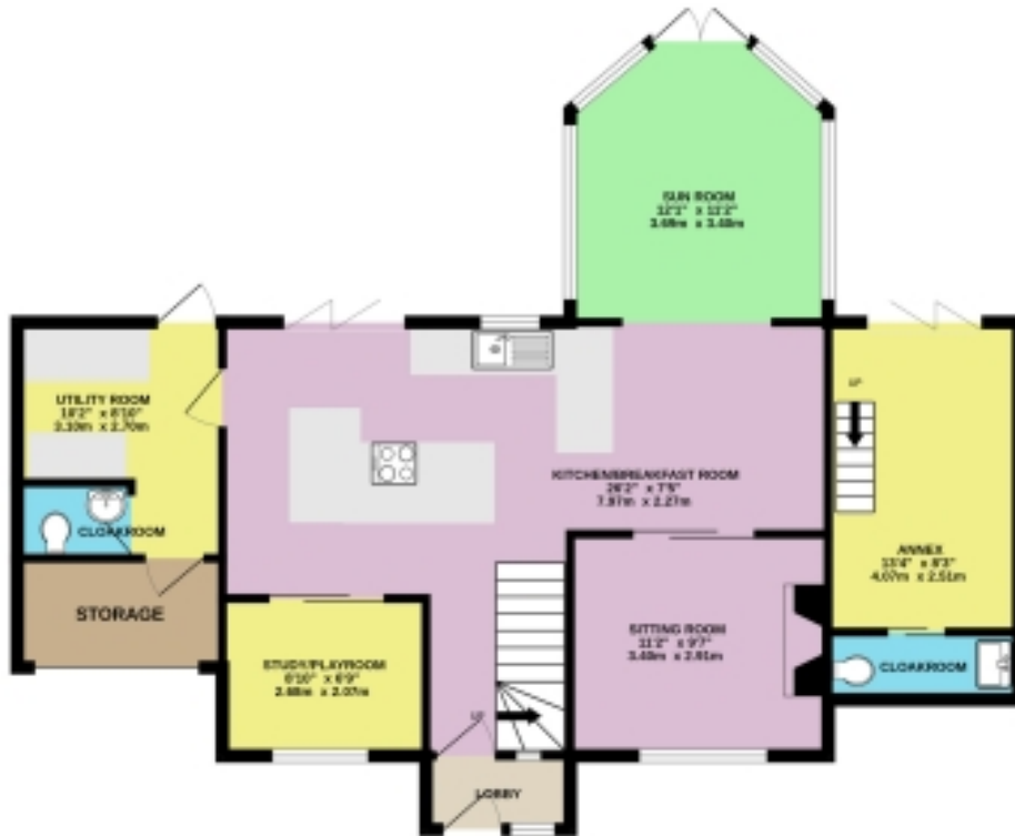
GROUND FLOOR 890 sq.ft. (82.7 sq.m.) approx.