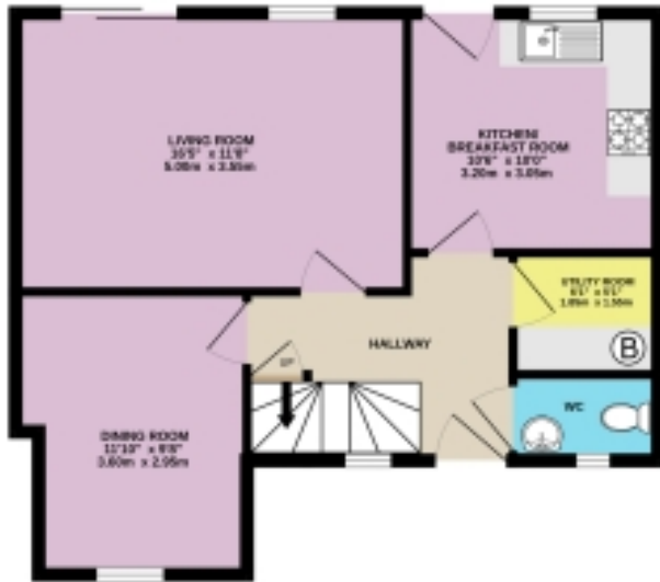
GROUND FLOOR 342 sq.ft. (31.4 sq.m.) approx.