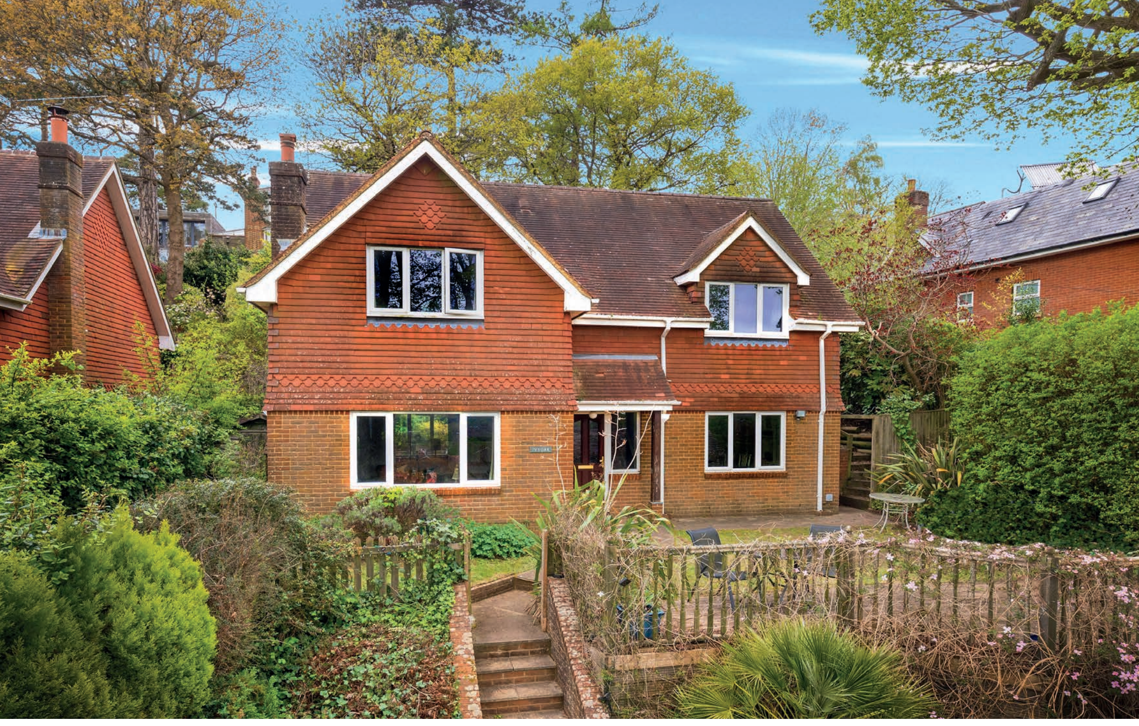
Ivy Oak, Shadyhanger Godalming, Surrey GU7 2HR Guide price £1,050,000 Freehold