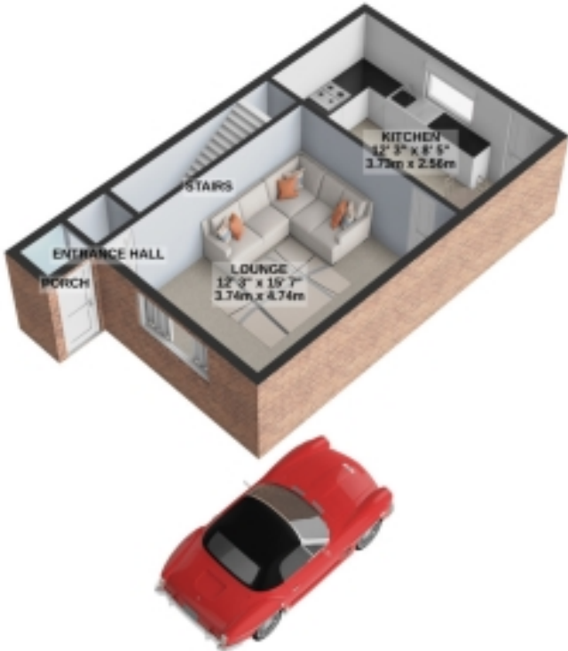
GROUND FLOOR 367 sq.ft. (34.1 sq.m.) approx.