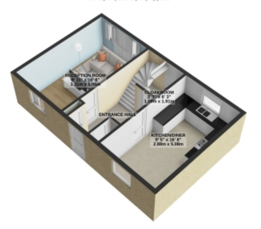
GROUND FLOOR 457 sq.ft. (42.5 sq.m.) approx.