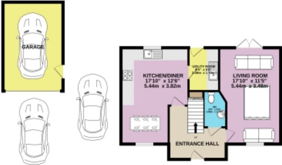
GROUND FLOOR 742 sq.ft. (69.0 sq.m.) approx.