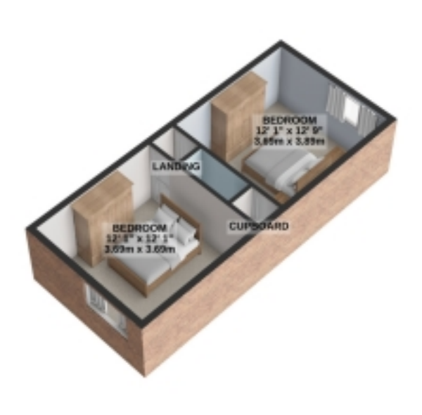
1ST FLOOR 320 sq.ft. (29.7 sq.m.) approx.

2-BED END OF TERRACE TOTAL FLOOR AREA: 819 sq.ft. (76.1 sq.m.) approx.